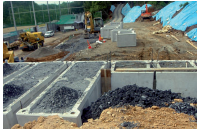
Fig. 2a, 2b: Precast box type-blocks