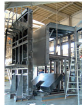
Fig. 3a, 3b: Examples of retaining wall molds used in Japan

the retaining walls can be built up to 10M by the combination of these various block sizes. They enhance the construction procedure by offering a more diverse, flexible, rational and economical design.