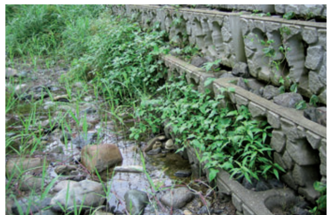
Fig. 1a, 1b: Hollow concrete blocks - mainly used for river revetment