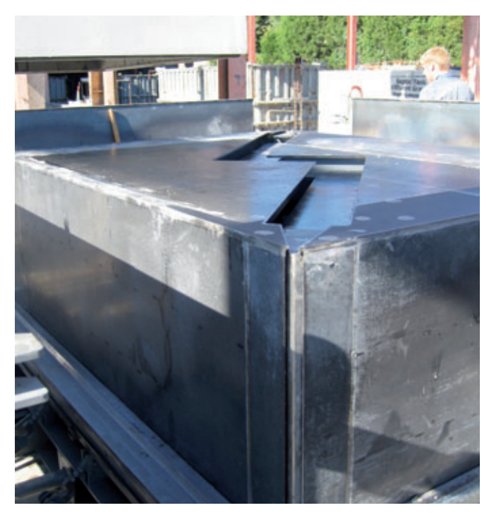
Toyota forms have a high reputation from operators due to the user-friendly design