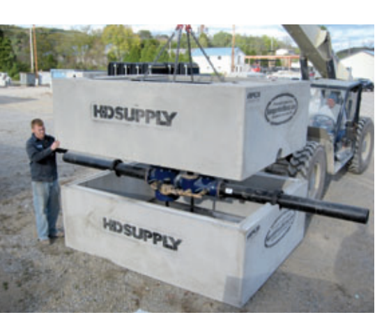
The quality of the form for precast concrete directly leads to the quality of the finished products

tapered inner core by using no hydraulic cylinders but mechanics. All the process to collapse the inner core is done by turning a lever, which takes only few seconds regardless of the size of the form.