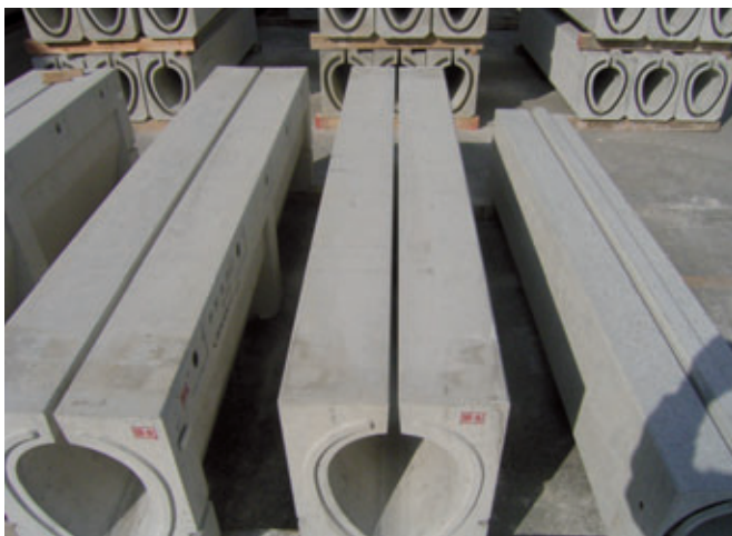
Fig 1: Egg-shaped roadside drain products

Since its establishment in 1966, Toyota Kohki, a mold and plant equipment designer and manufacturer for precast concrete has