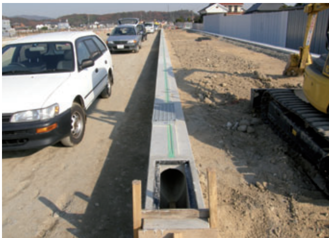
Fig 3: Construction site