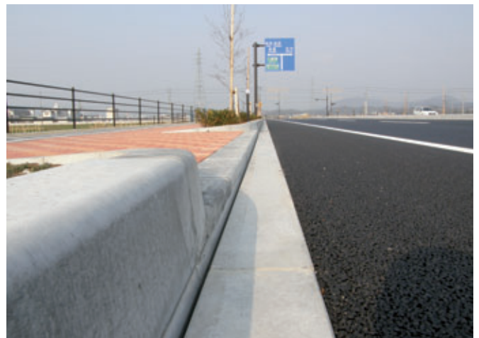
Fig 4: Completion of construction