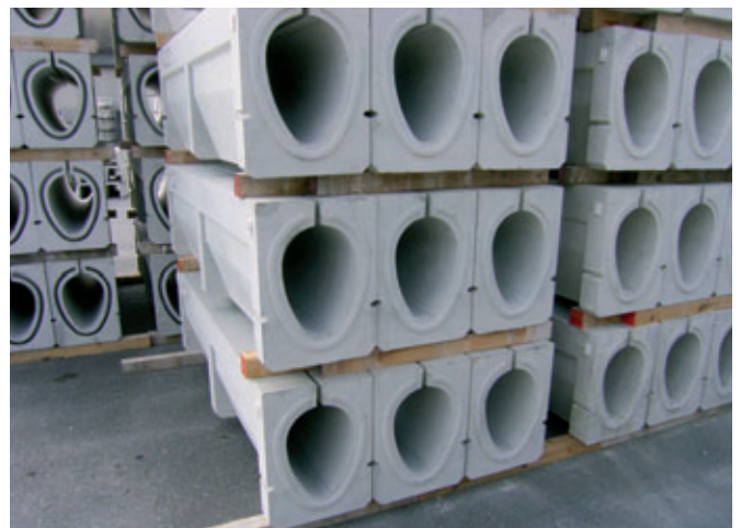
Fig 2: Products at stockyard